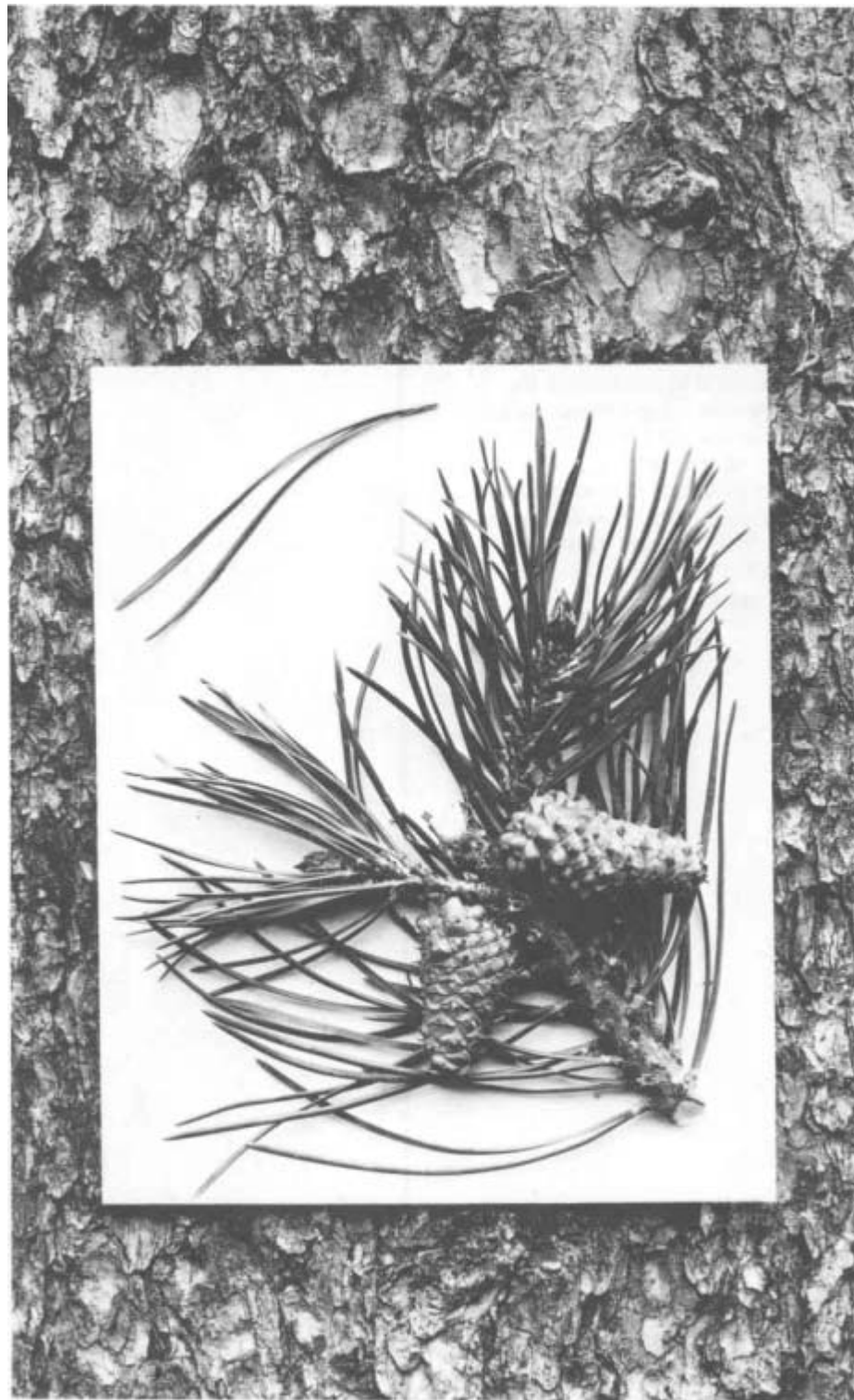
Figure 2—Typical barks, needles, and closed cones of lodgepole pine.

Mature lodgepole pine varies greatly in size. In the moist Sierra Nevada Mountains of California, trees reach average breast high diameters (4.5 feet from the ground) of 15 to 18 inches and heights of 90 to 100 feet in 100 years. In eastern Oregon, trees 100 years old average 7 to 13 inches in