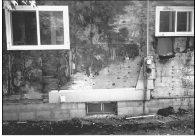
Example of major damage due to excessive moisture buildup.

Maintaining a reasonable level of indoor humidity (about 40% or less) is the most effective method of moisture control. This level can often be maintained with minimal heat loss by using exhaust fans in the kitchen and bathrooms or a central ventilation system. Another option that reduces heat loss but maintains sufficient ventilation is an air-to-air heat exchanger. Dehumidifiers can lower indoor humidity in regions with milder and more humid winters; because they are generally designed to operate at higher temperatures and humidity levels, dehumidifiers are often not practical in cold winter climates.