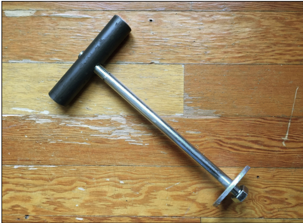
Figure 2. Prototype panel connector.

A panel connection system is being developed and tested that is similar in design (albeit much more heavy duty) to that used in the furniture industry (Fig. 2). These doweled fasteners would be simple to install and allow the butting of panels with little field modification. Full-size lateral load tests will be performed on an assembled safe room (8 by 8 by 8 ft in size) to verify the integrity of the developed connection system and lateral wind pressure resistance of the shelters.