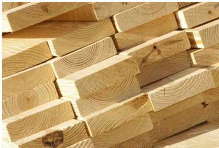
Figure 1 Dimension lumber.

Softwood lumber is used in construction for both structural and non-structural purposes. Softwood lumber has been produced into a wide variety of products from many different species. However, almost all softwood lumber is produced as dimension lumber which is nominally 38 mm to 89 mm thick (2 to 4 inches) and 89 mm to 305 mm wide (4 to 12 inches) (Figure 1). Dimension lumber and boards of some species may be green or dry but most lumber produced in the USA is dried. By definition, dry boards and dimension lumber has been seasoned or dried to a maximum moisture content of 19%. Lumber can also be produced either rough or surfaced (planed). Rough lumber serves as a raw material for further manufacture and also for some decorative purposes. For example, a roughsawn surface is common in post and timber products. Surfaced or planed lumber has been surfaced by a machine on one side or two sides, one edge or two edges or combinations of sides and edges. Lumber is surfaced to attain smoothness of surface and uniformity of size. This LCA report is for planed (surfaced), dry, dimension lumber produced from logs.