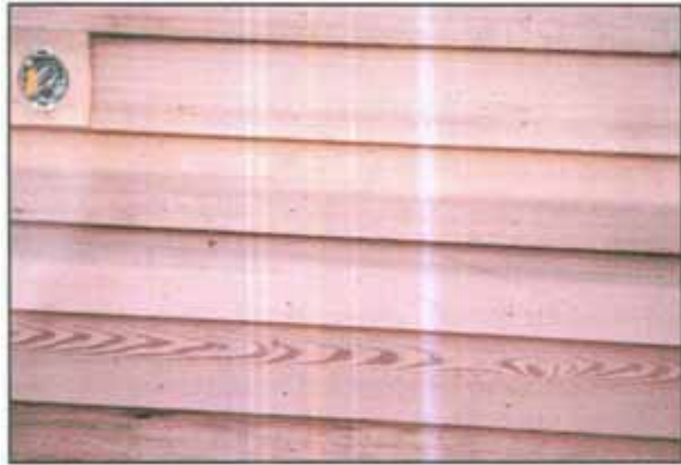
Flat vs. Edge Grain