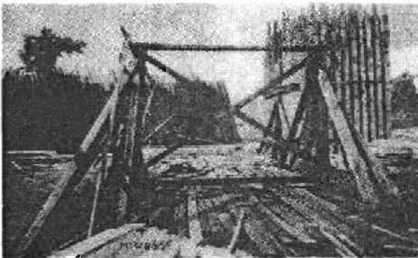
Figure 3. --End piling.