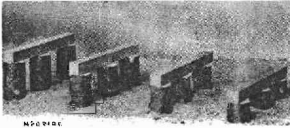
Figure 1. --Foundation for piling of softwoods.