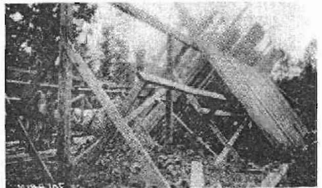
Figure 4. --End racking.